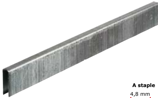
A staple 4,8 mm